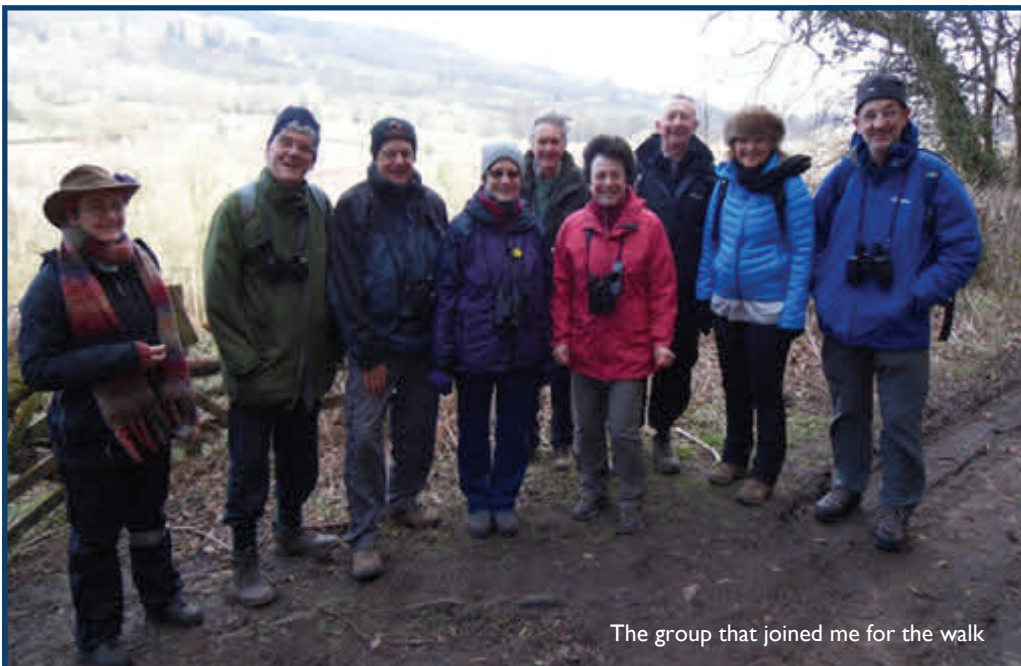
The group that joined me for the walk